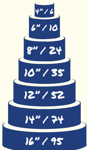
CUTTING CAKE CAKE SIZE / SERVING SIZE

*PLEASE NOTE, IF YOU ARE REFERRED TO US BY KIMPTON OR ROYAL SONESTA, THERE IS A DIFFERENT PRICING STRUCTURE THAT IS APPLIED TO THE CAKES AS THEIR PREFERRED VENDOR.